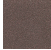
Rusty Rush - 10